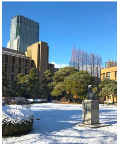
Katahira Campus of the Tohoku University

One city that has recently come to our attention that we hadn't even thought of before is Sendai. For one thing, our first contact with missionaries in Japan was a couple who did student work in Sendai.