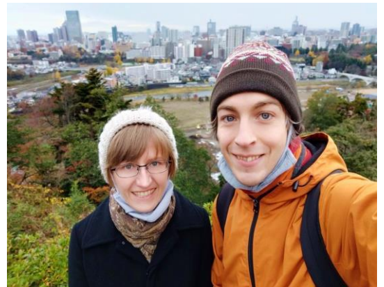
View of downtown Sendai from Aoba-Yama castle hill

Since our language training is coming to an end in the foreseeable future (August 2022 is planned), we have been praying for some time about how we should continue after that, and where we should start our ministry. We want to let God guide us in this question and are open to any place He