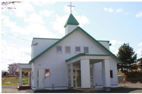
The new church building

The church, where we will be allowed to serve and study from October on, was founded in 1992. It currently has only about 30