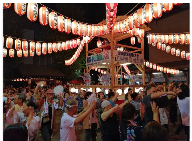
Bon Odori participants dance after sunset around a festively decorated tower with drummers and other musicians.

These days, like every summer, Obon (お盆) is celebrated in Japan. It is one of the three important festive seasons in Japan, along with New Year and Golden Week, and takes place in different parts of Japan at different times. It is believed that during this Buddhist festival, which originated in China, the spirits of the deceased return to the world of the living and visit their relatives. It is there-