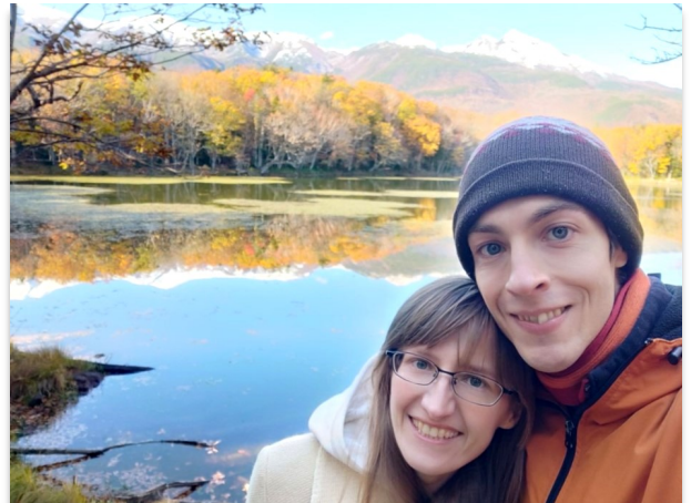
Excursion to the Shiretoko Peninsula. The mountain range in the background continues eastward into the sea, forming the Kuril Islands.

During our vacation we had the opportunity to tour the beautiful nature around Kitami – what a contrast to the concrete jungle in Sapporo. Here, after ten minutes of cycling, you are in the forest or next to one of those huge onion fields. We took a day trip to the national park on the Shiretoko Peninsula, where you can have a walk around five beautiful lakes. On another day we were at a remote mountain lake, where we saw lonely nature lovers with tents and fishing rods enjoying the silence. On the way there, two gigantic deer and a fox crossed our path.